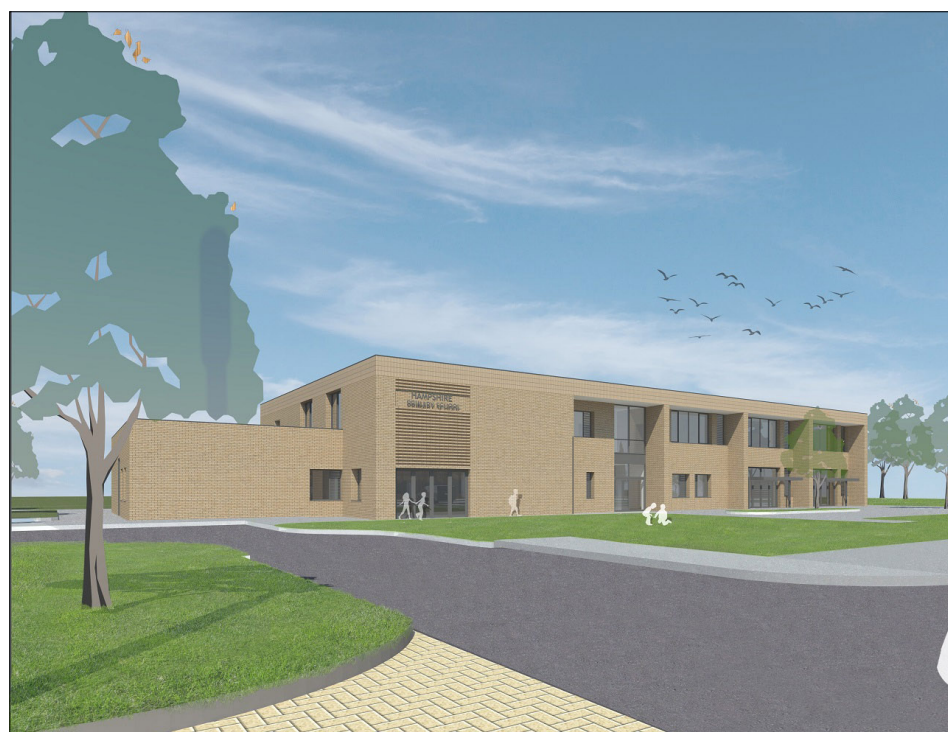
Perspective view of school frontage